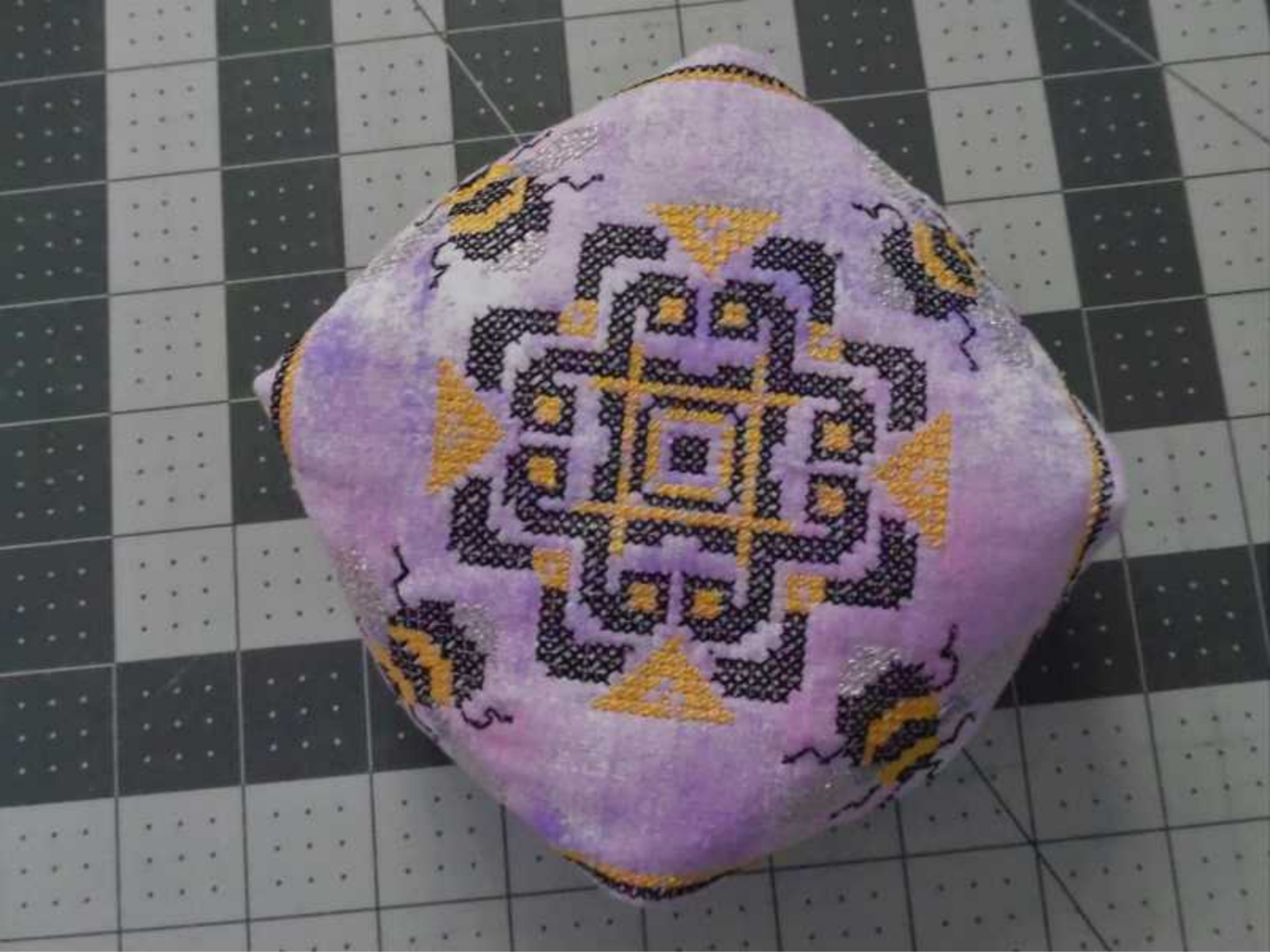
8. Top side