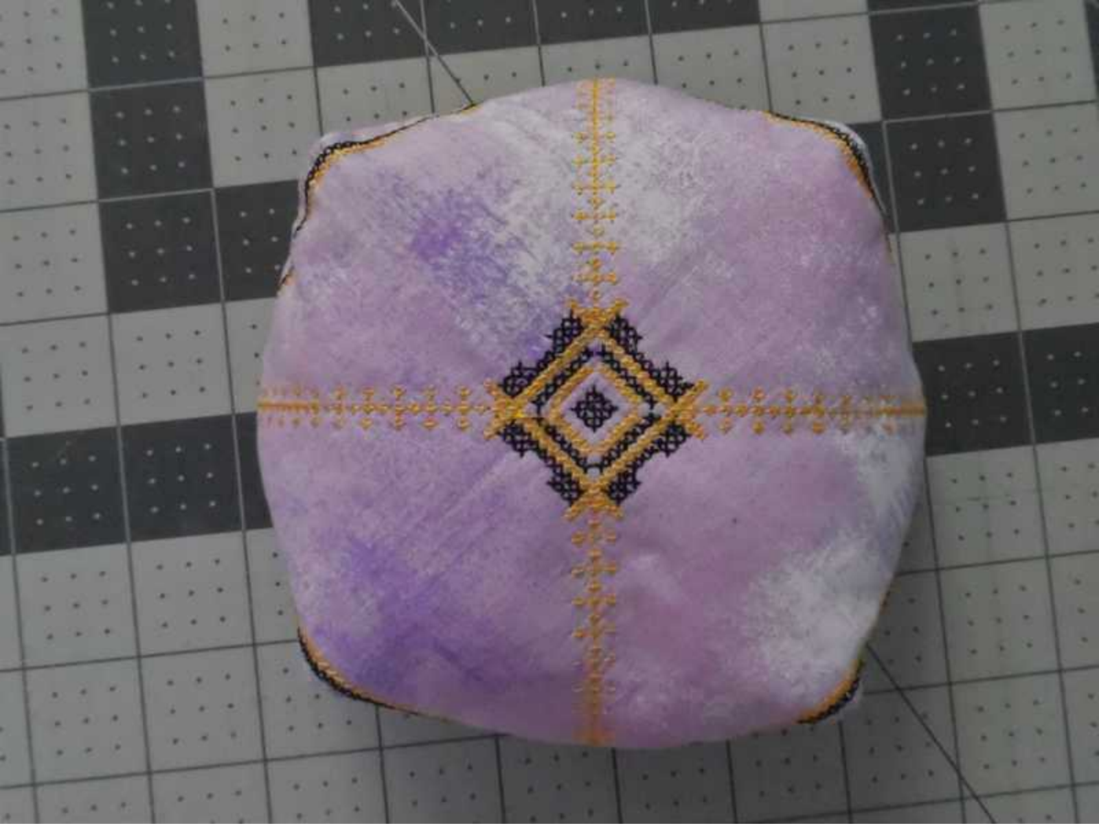
9. Bottom side